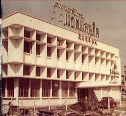
Atlantic Laboratories Corp., Ltd.

1962 Founded "Atlantic Laboratories Corporation"