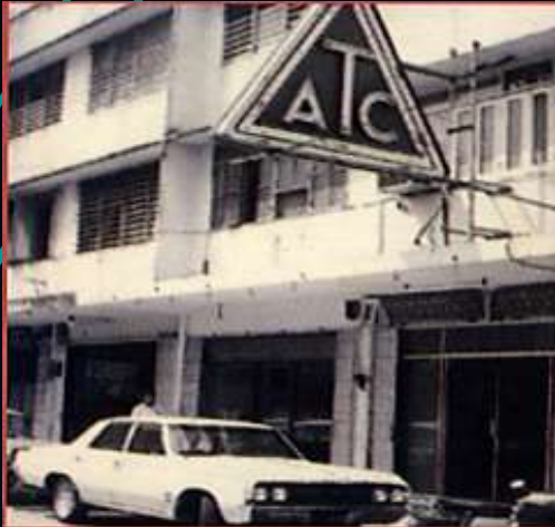
Atlantic Trading Co., Ltd.