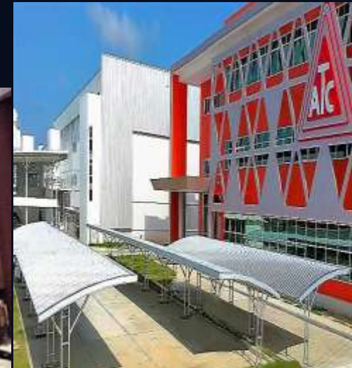
Atlantic Laboratories Corp., Ltd.