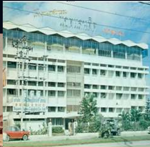
Atlantic Laboratories Corp., Ltd.