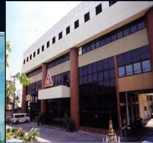
Atlantic Laboratories Corp., Ltd.